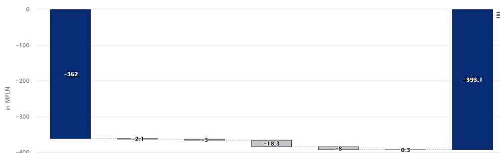
Chart. Fixed costs

Fixed costs were higher than in 2019 by 31.1 MPLN (9%).